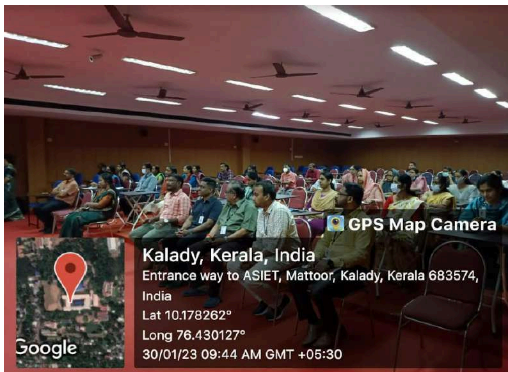
Lobby in main block